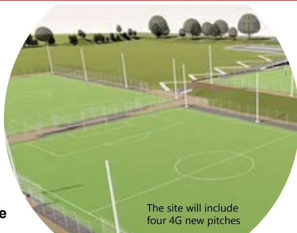
The site will include four 4G new pitches

We've been working with Leeds University from the start of the project and we're just waiting to confirm new training slots for all our teams. We'll also be hosting regular home games for both seniors and juniors at the hub.