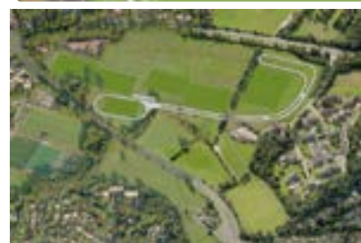
Ariel view of Bodington Playing Fields